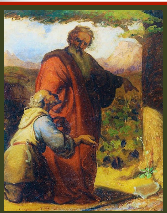
"The Parable of the Barren Fig Tree" Detail c. 1850 Carl Rahn

9136 Riverside Drive Descanso, CA 91916 www.ourladyoflight.church