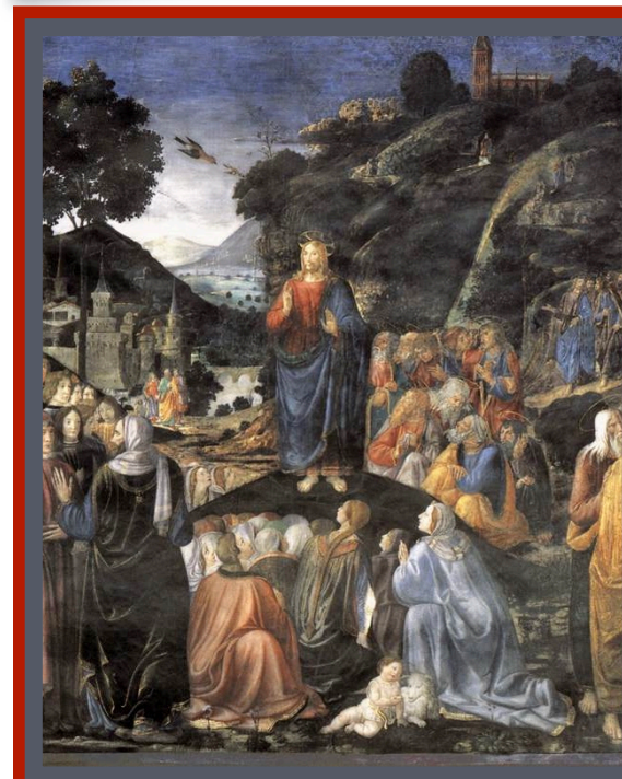
"Sermon on the Mount" Detail c. 1481-1482 Cosimo Rosselli

9136 Riverside Drive Descanso, CA 91916 www.ourladyoflight.church