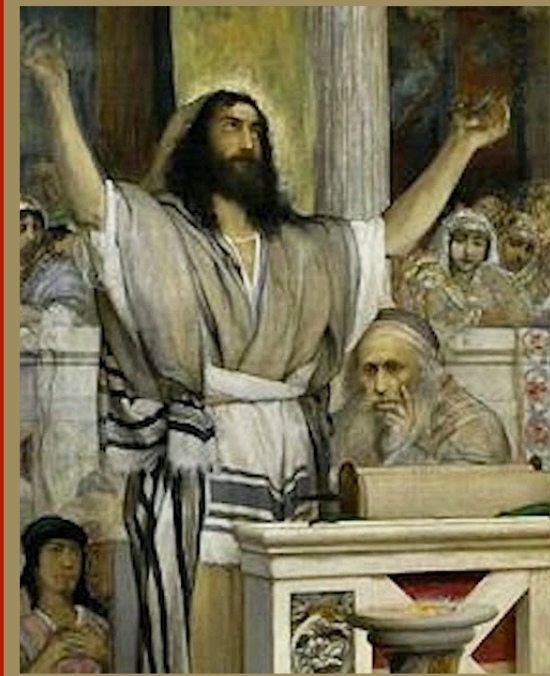
Jesus' Mission Statement Date Unknown Artist Unknown

9136 Riverside Drive Descanso, CA 91916 www.ourladyoflight.church