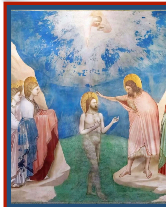
"The Baptism of Jesus" Detail c. 1303-1305 Giotto

9136 Riverside Drive Descanso, CA 91916 www.ourladyoflight.church