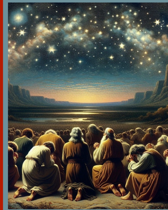
The Gospel According to Mark Date Unknown Artist Unknown

9136 Riverside Drive Descanso, CA 91916 www.ourladyoflight.church