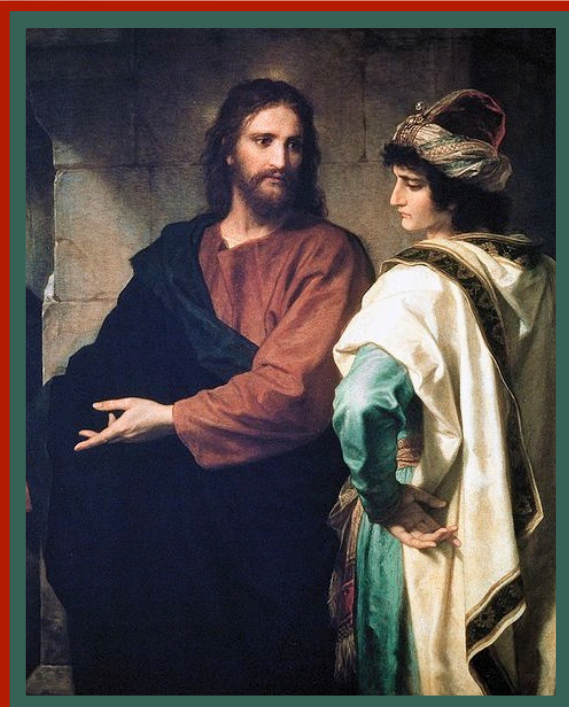
"Christ and the Rich Young Ruler" Detail c. 1889 Heinrich Hofmann

9136 Riverside Drive Descanso, CA 91916 www.ourladyoflight.church